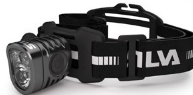
EXCEED 2XT / LIMITLESS EXCEED 2